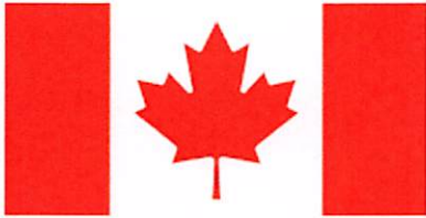
National flag of Canada