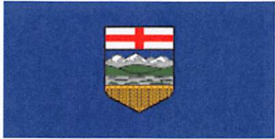
Provincial flag of Alberta