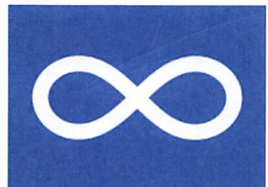
Metis Nation flag